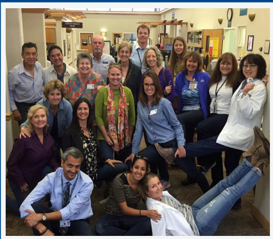
A few of our talented staff pose for a photo on Denim Day in support of sexual assault awareness.